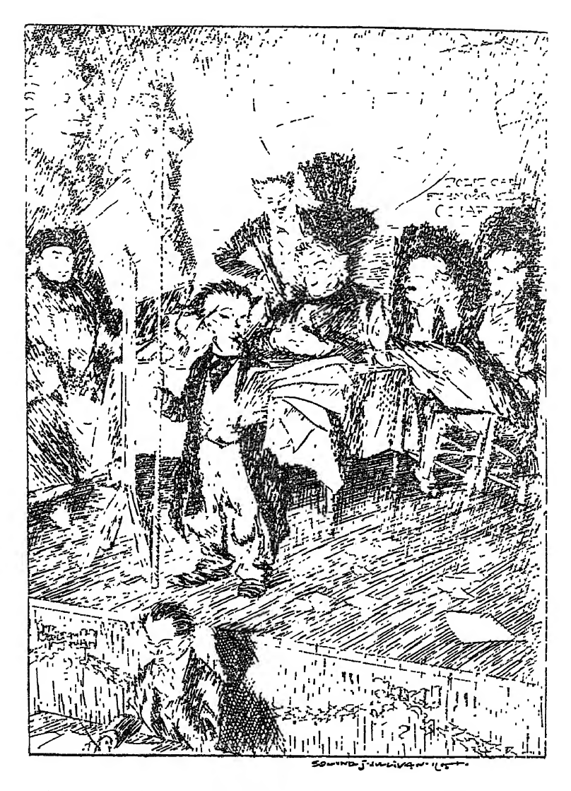
"ONE OF THOSE QUEER GERMAN PROFESSORS WHO WRITE INSANITY ABOUT WELT-POLITIK" (see p. 344).